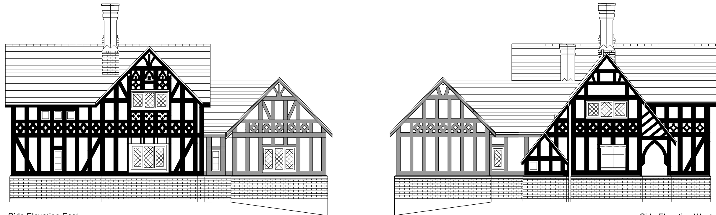
Side Elevation East